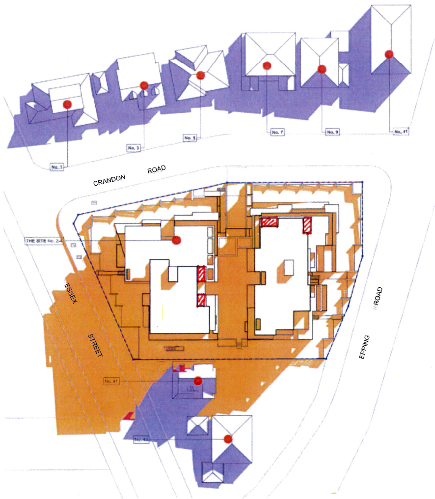
JUNE 21 - MID WINTER - 9:00AM